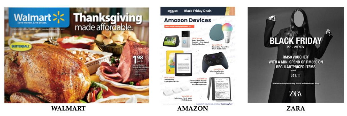
Figure 2: Thanksgiving and Black Friday Promotion Campaigns by E-Commerce Companies