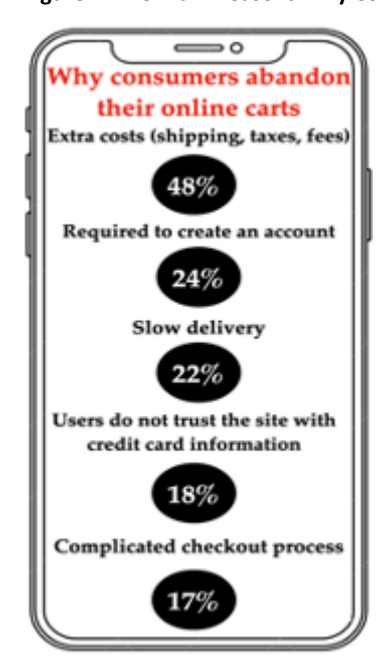
Figure 1: The Main Reasons Why Consumers Abandon Their Online Carts