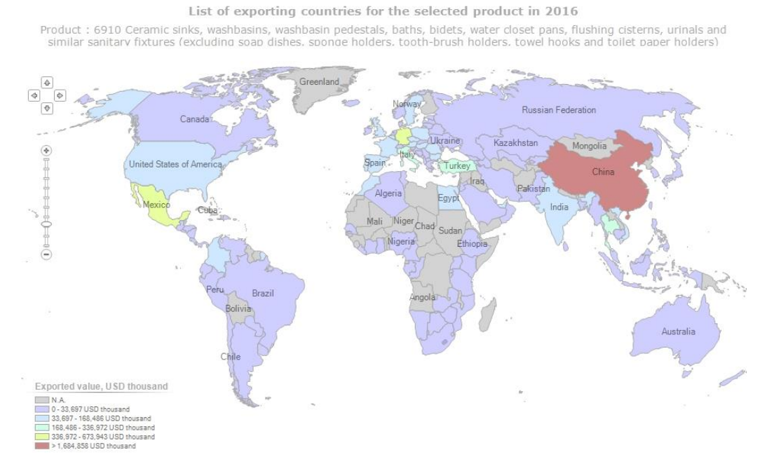
Figure 1: List of Exporting Countries for the Ceramic Sanitary Ware Industry in 2016

Source http://www.trademap.org/Index.aspx March, 20, 2017