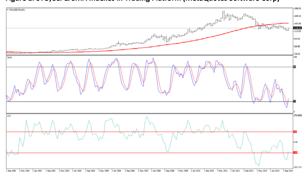
Figure 1: STO,CCI & SMA Indexes in Trading Platform (MetaQuotes Software Corp)