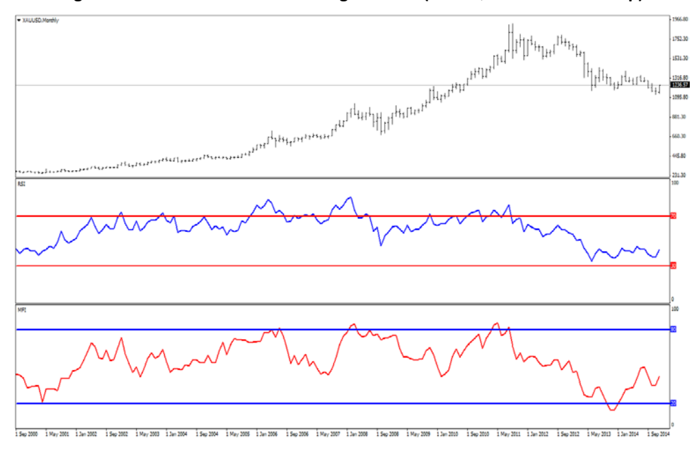
Figure 3: RSI & MFI Indexes in Trading Platform (MetaQuotes Software Corp)

The Money Flow Index (MFI) is an oscillator that uses both price and volume to measure buying and selling pressure. Created by Gene Quong and Avrum Soudack, MFI is also known as volume-weighted RSI. MFI starts with the typical price for each period. Money flow is positive when the typical price rises (buying pressure) and negative when the typical price declines (selling pressure). Typically, MFI above 80 is considered overbought and MFI below 20 is considered oversold. Strong trends can present a problem for these classic overbought and oversold levels. MFI can become overbought (>80) and prices can simply continue higher when the uptrend is strong. Conversely, MFI can become oversold (<20) and prices can simply continue lower when the downtrend is strong. Quong and Soudack recommended expanding these extremes further qualify signals. A move above 90 is truly overbought and a move below 10 is truly oversold. Moves above 90 and below 10 are rare occurrences that suggest a price move is unsustainable.