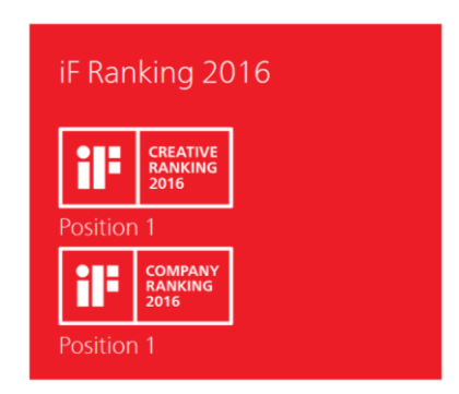
Figure 3: IF Ranking Logo (<u>http://ifworlddesignguide.com/if-ranking/</u>)

Award-winning designs are presented in IF design exhibition Hamburg. An internet platform exists where awarded designs are featured in. Winners can receive a free profile on this platform. In addition, IF design app, which has iOS & Android versions, presents award-winning entries of the IF Design Award from the last three years. IF also launches its schedule of international press after the jury session to support the winners' communications. An award ceremony and design party is carried out for award winners as well. Professional photographers take photos, which can be downloaded and used for communication measures. Winners receive certificate during the IF design award night in printed and digital as well. Certificates can be used without any limitations for promotion activities.