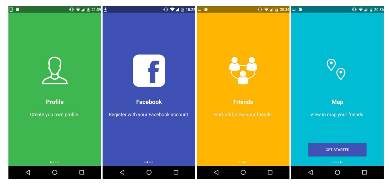
Figure 2: Initial Interface of the Mobile App